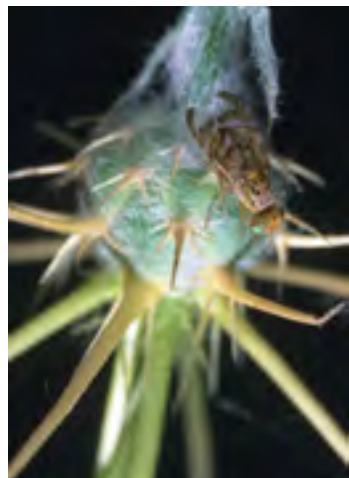
Left: The peacock fly is one of several small flies imported to help control starthistle. This one is laying an egg on a spiny bud. The larvae of this fly will feed inside the flower head and prevent it from setting seed.

The Effie Yeaw staff continue to evaluate protocols for reducing yellow starthistle that will protect native plants and animals and avoid fires on the preserve.