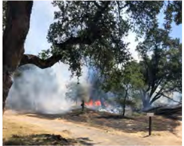
July fire on the Main Trail.

Quick thinking by staff and volunteers prevented injury to visitors and wildlife and a speedy response from the Sacramento Metro Fire Department kept the fire from spreading beyond about an acre.