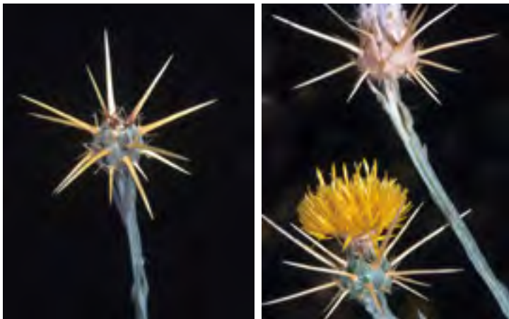
Yellow starthistle bud in spiny stage (left); full bloom and seed dispersal stages (right).

Native to the Mediterranean region, yellow starthistle was introduced into California in the 1800s, possibly as a crop seed contaminant. Although its initial spread was slow, by the last half of the 20th Century starthistle had become a very serious weed. It now infests up to 15 million California acres, mostly in disturbed sites such as pastures, rangeland and natural areas. It outcompetes native plants, depletes soil moisture, and is a rapid colonizer. Its spines are a nuisance for hikers and it is poisonous to horses.