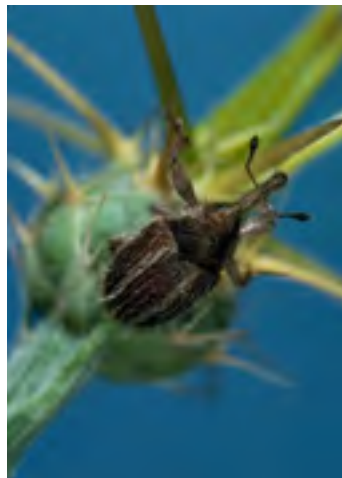
Right: The yellow starthistle hairy weevil was imported from Greece and is now widespread in our area. Its larvae can destroy up to 100% of seeds in seed heads.