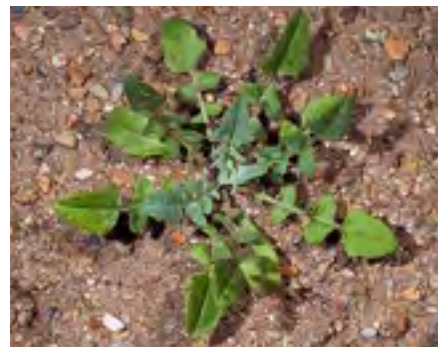
Starthistle grows as a low rosette developing its deep roots for most of winter and spring.

Stems and flower stalks bolt up out of the rosette in late May or June after other plants have started to shrivel. Over the course of 6 to 10 weeks flower buds develop spines, flower, form seeds and dry out. Flowers of various stages may be found on a single plant.