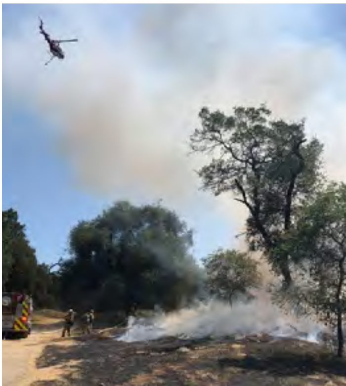
Sacramento Metro Fire sent a helicopter and several engines to battle the blaze.

The fire has stimulated staff to consider how the Center's emergency response plans can be improved in the future. Staff are working closely with Metro Fire on this effort. They are also looking at safer ways to manage the yellow starthistle problem (see yellow starthistle article). And Effie Yeaw Naturalists are very interested in following the fire's impact on the plants in the burned area. Perhaps we will see new or more wildflowers and less starthistle in that area next year?